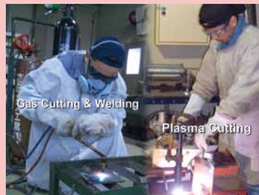
Gas Cutting &amp; Welding

From October 8, 2025 (Wednesday) to March 6, 2026 (Friday) (There are no classes on Saturday, Sunday and public holiday)